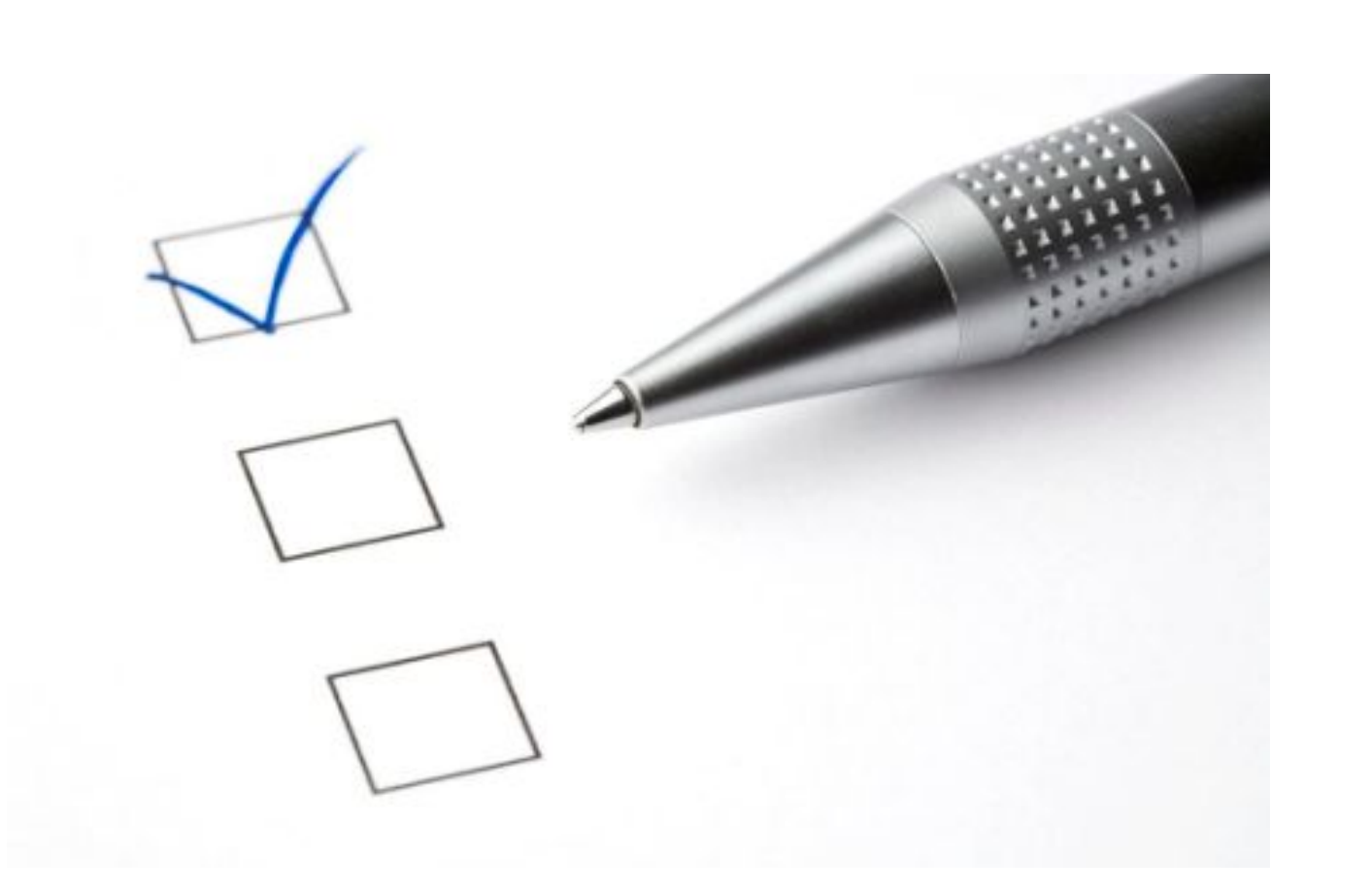
78 Students Surveyed

This report was commissioned to identify and investigate the effect of Brexit primarily on EU students. It also compares the opinions of students from other backgrounds. The aim is to identify students' attitude towards Brexit, education and their tendency to leave, begin or continue higher education in the UK.