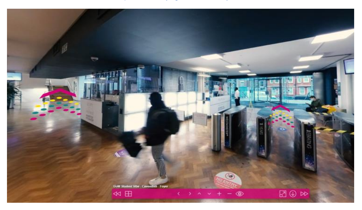
Fig. 4. Arrows allow navigation in different branches of the narrative.

The users can choose the angle to view the scene by moving the scene with their mouse if they experience it using a desktop browser, or by moving their head if they are using a head-mounted display